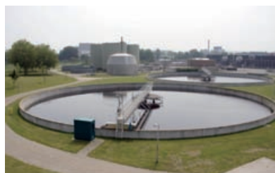
Waste water treatment