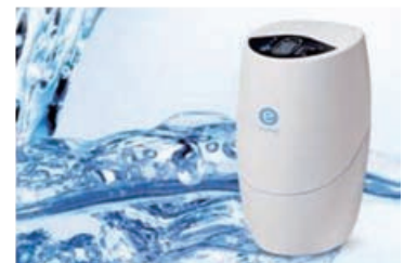
Alkaline water generator